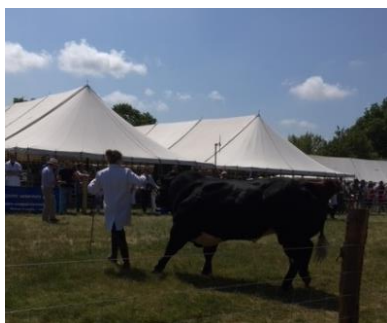
Note this chap did behave!