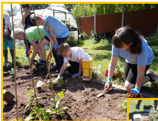
2017 Special school winners Thriftwood School