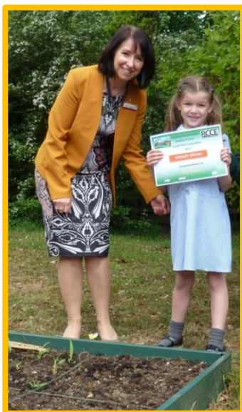
2017 School winners Danbury Park Community School

This year it could be your school benefitting from fantastic prizes and the chance to plant their design!